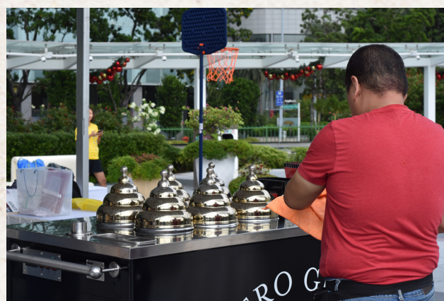
One of the best gelatos in town - Alfredo Gelato served up timeless flavours such as Hazelnut, Ferrero Rocher, Pistachio and Chocolate