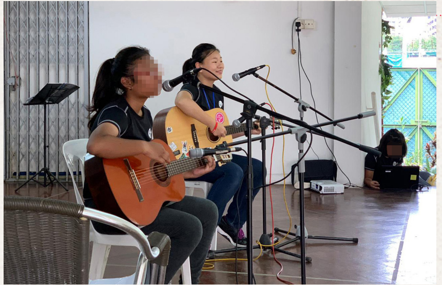
Original song performance by our GP resident!