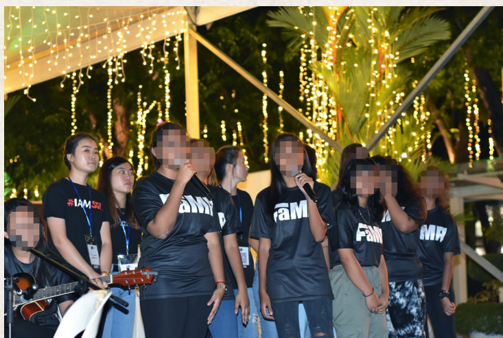
Song cover by our residents of the classic inspirational song You Raise Me Up by Josh Groban