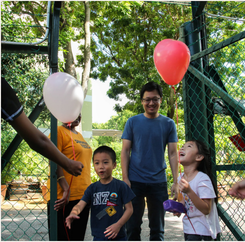
Our residents greeting visitors at the gate with balloons