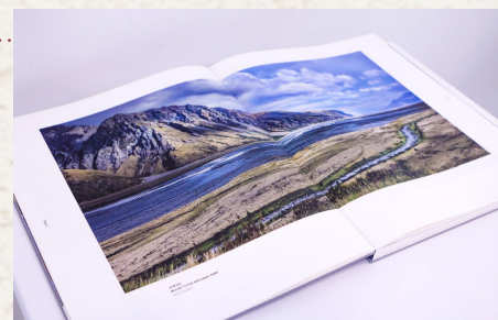
Exclusive Metal Print (top) and Premium Photobook