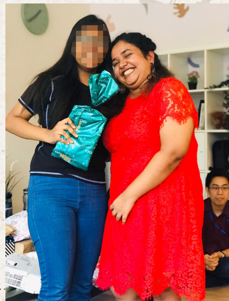
Our staff and Girls exchanging gifts at the unveiling of their Angels & Mortals!