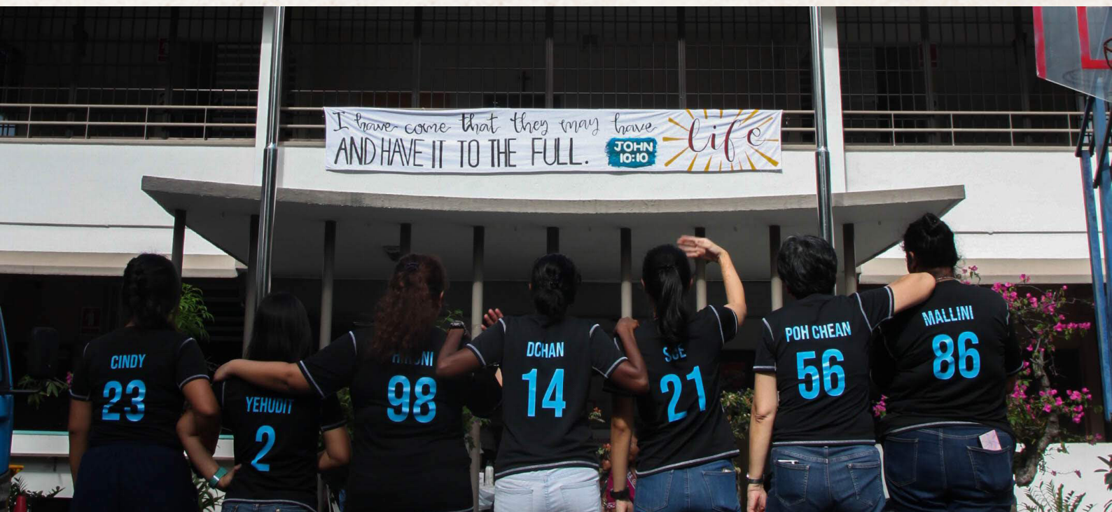
The Youth Workers and Family Care Officers of Gladiolus Place!

Our new and refreshed logo incorporates the gladiolus flower and captures the youthfulness and vibrancy of Gladiolus Place and her beneficiaries whom we are privileged to journey with!